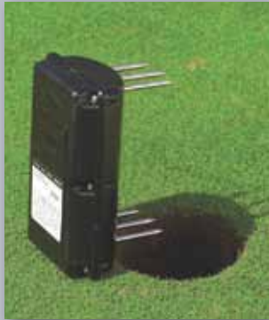
Wireless Sensor Measures Moisture, Temperature and Salinity Levels